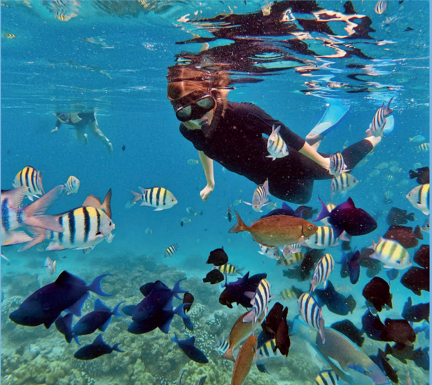
Luci Ostheimer snorkeling in Aceh, Indonesia